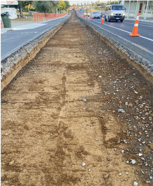
SH3 Ōhaupō during road rebuild

NZ Transport Agency Waka Kotahi (NZTA) would like to acknowledge how disruptive this work was for residents, shop owners and the general travelling public. NZTA thanks everyone for their patience over the past 6 weeks.